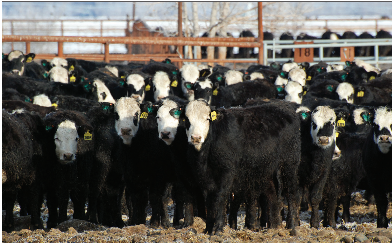
A 4,300-head closed feedlot located at Hysham, Mont., allows the Bormans to background their black baldie calves for 45 to 60 days before delivering them to buyers.